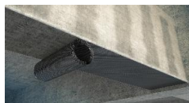
Pasting carbon fiber cloth