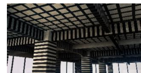
Curing and protecting