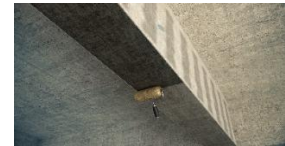
Applying epoxy resin adhesive