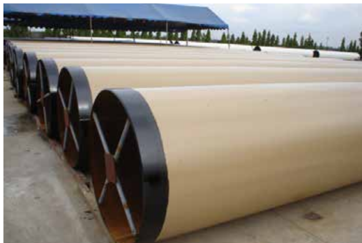
Belzona 5811 used for buried pipe protection

Belzona 5811DW2 is WRAS approved for potable water contact.