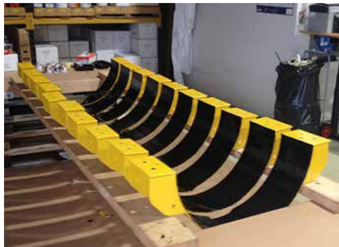
Splash zone clamps coated

This fluid material is easy to mix and apply without the need for specialist tools and cures at room temperature eliminating the need for hot work