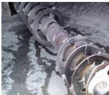
Screw Auger before coating