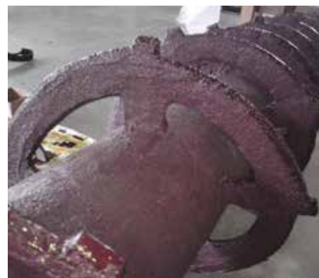
Screw Auger coated in Belzona 1811

For more information, please contact your local Belzona representative: